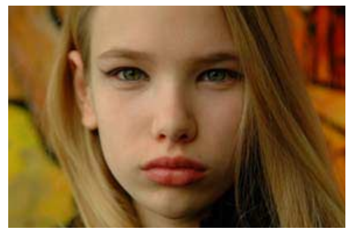
Exposure: Open Aperture Auto ISO100 (Taken by a film camera.)